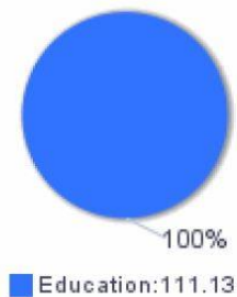
Table 1: MSYs by Focus Areas